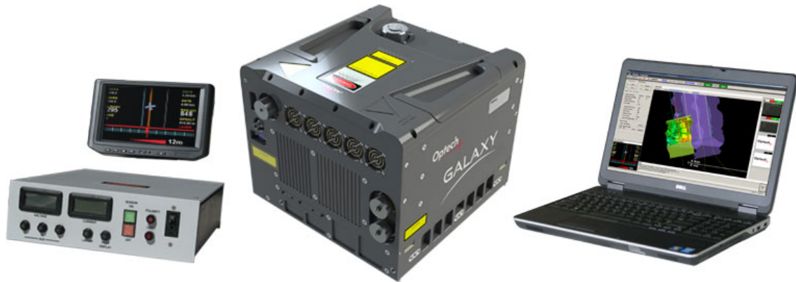
Figure 2 – Optech Galaxy components

The Galaxy was mounted on Piper Navajo fixed wing Aircraft.